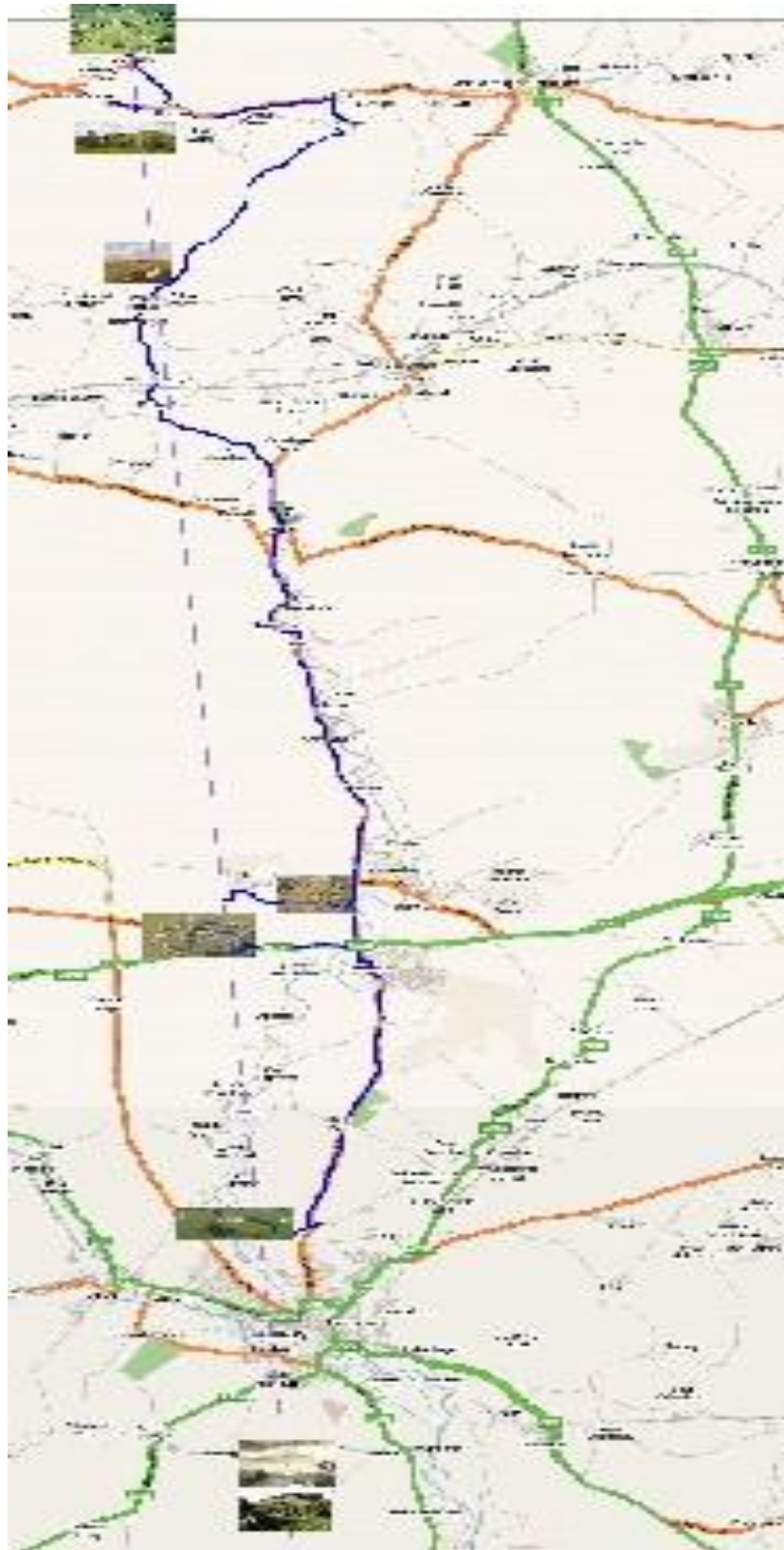
The purple dotted line shows the ley line. The blue solid line shows the route we drive